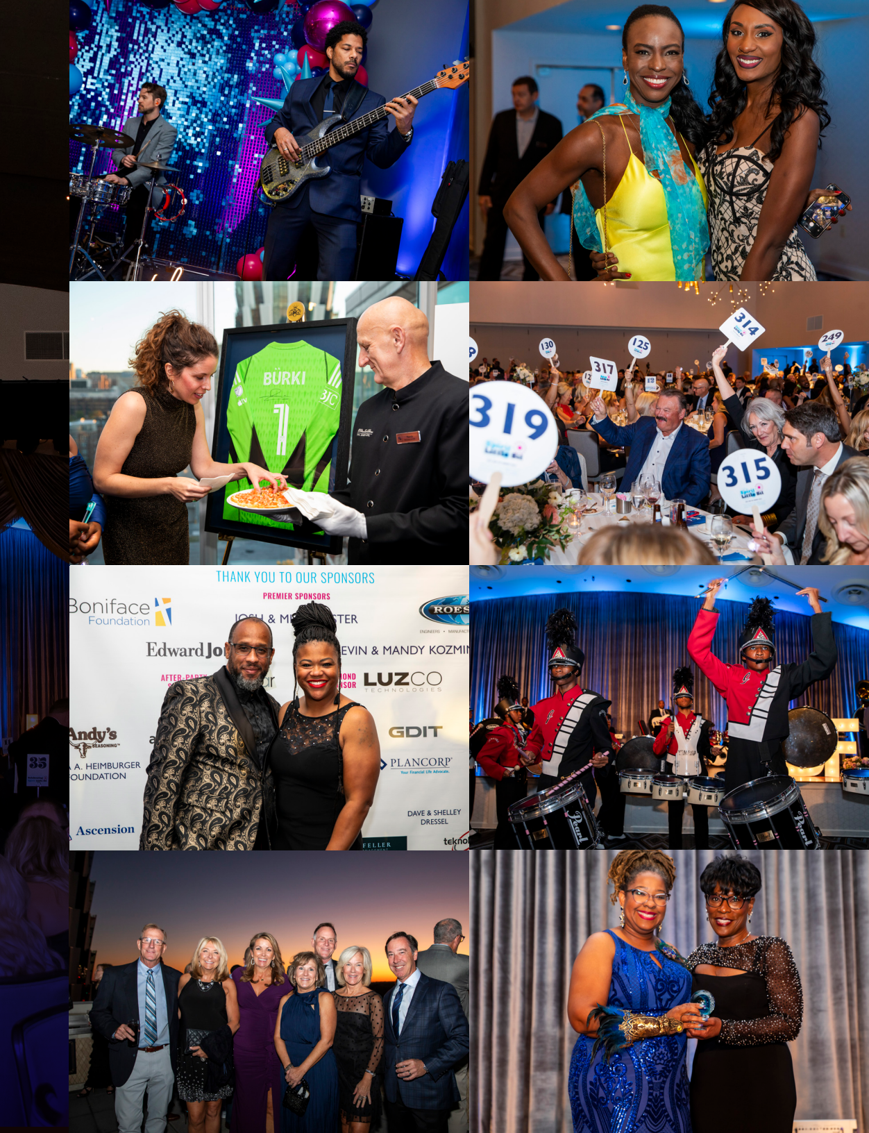
Table of 10: $2,500